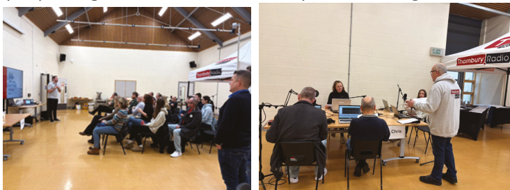
Presenter Academy Day participants getting to grips with technology to create radio links

Following the success of this first Academy Day, Thornbury Radio plans to run future sessions and continue investing in opportunities that empower local people to get involved in community broadcasting.