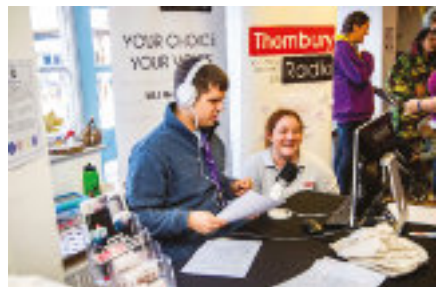
Thornbury Radio providing the opportunity to become a radio presenter